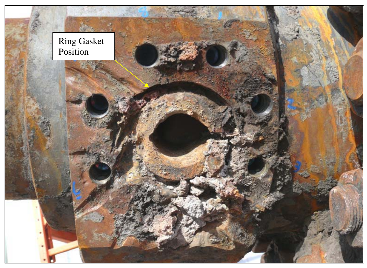
Figure 3. Casing bowl sealing faces