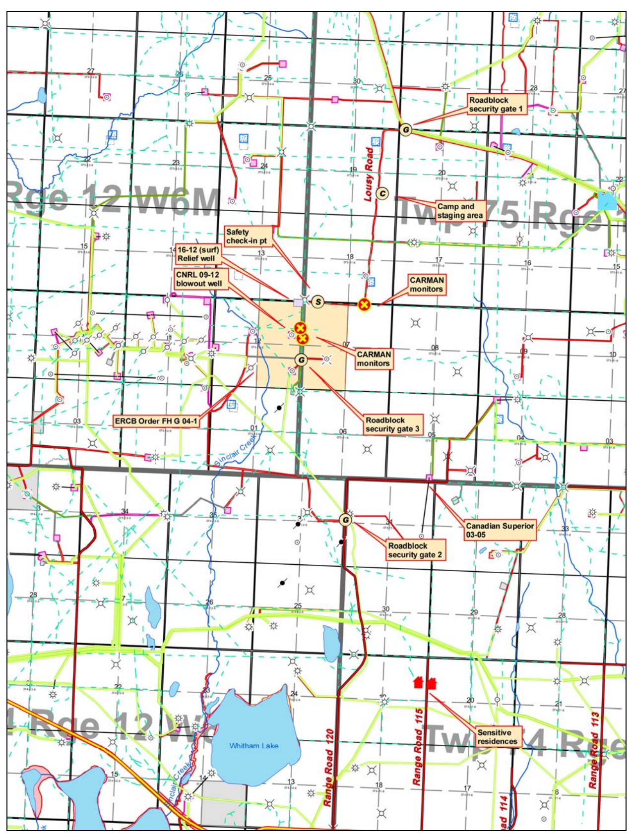
Figure 1. Area map